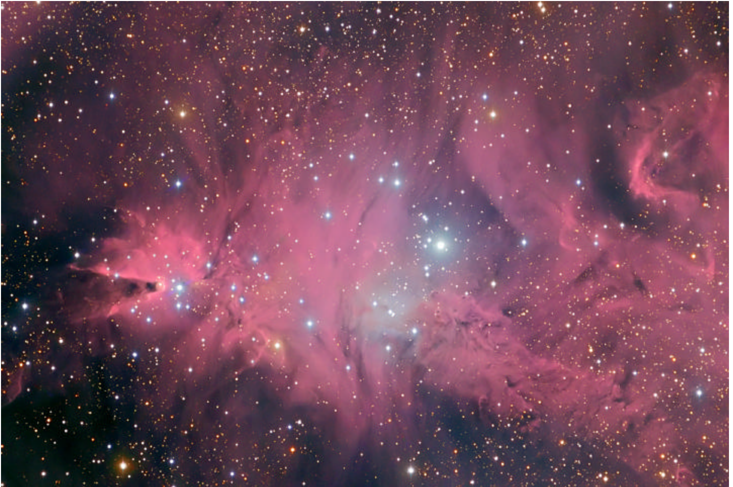
This is a picture of the Cone Nebula/Christmas Tree Cluster region that I just finished up. It was taken with my AP 130mm EDF telescope using a ST-10 XME camera